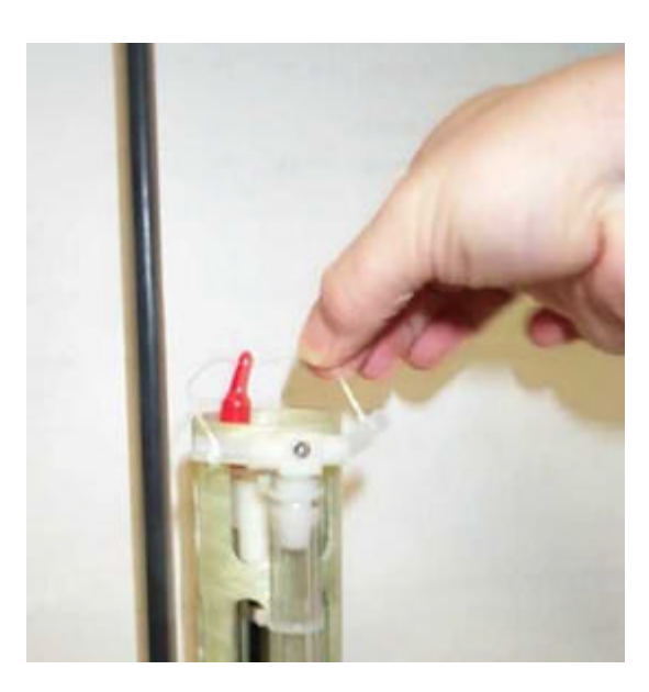
IMPORTANT: Remove plastic bag and three plugs from CTD sensor , if they have not already been removed.